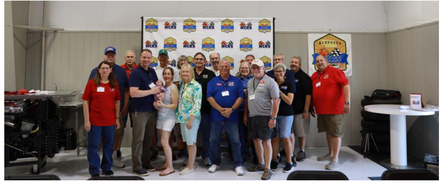
(Continued to Page 10)